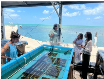
Touring Keys Marine Laboratory and exploring its programs, research, and impact.