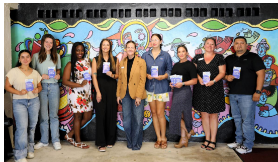
Distributing Keys Resource Guides to SOS Foundation and touring their Key West facility.