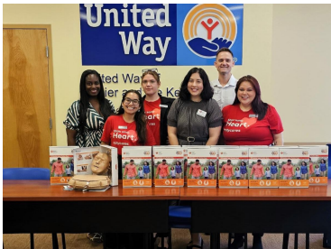
A huge thank you to American Heart Association and CITY Furniture for donating CPR Training Kits to our United Way office.