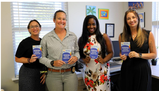
Distributing Keys Resource Guides to every deputy with the Monroe County Sheriff's Office.