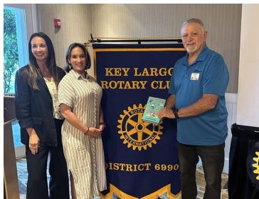
Sharing updates on UWCK programs, new partners, and upcoming initiatives with the Key Largo Rotary.