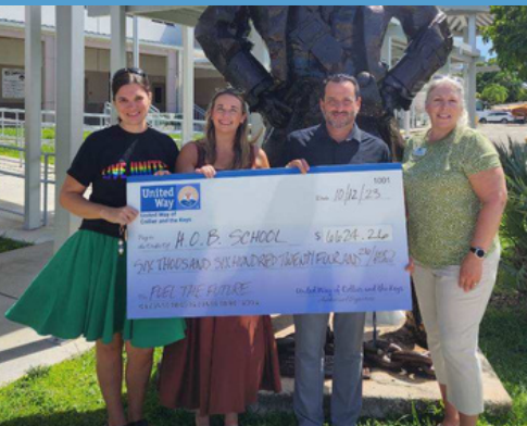
Horace O'Bryant School