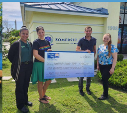
Somerset Island Prep