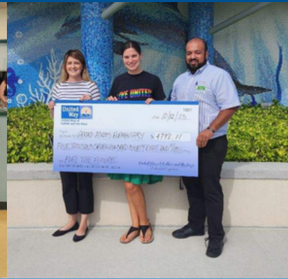
Gerald Adams Elementary