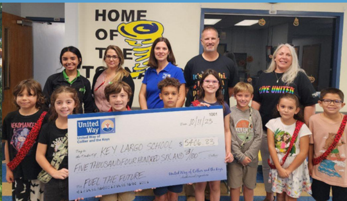
Key Largo School