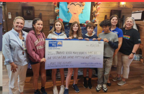
Treasure Village Montessori