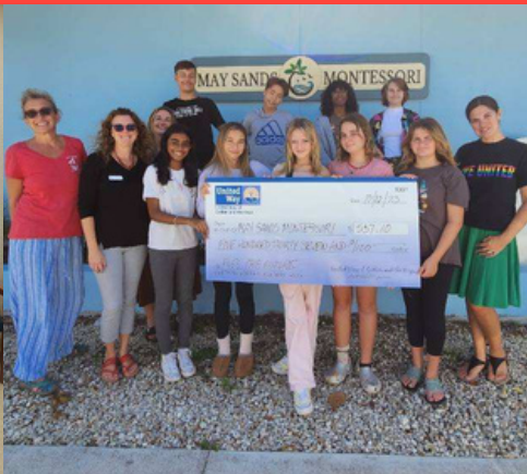
May Sands Montessori