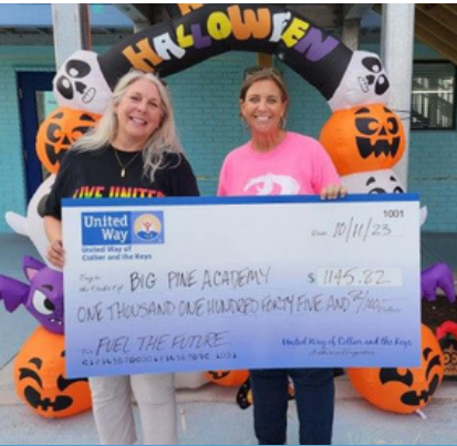
Big Pine Academy

From generous donors throughout the Florida Keys.