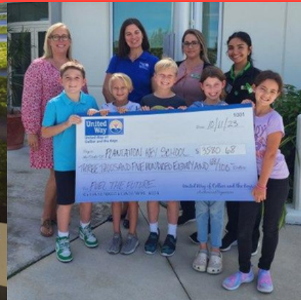
Plantation Key School