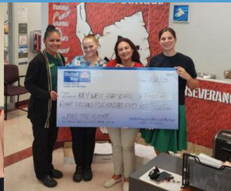
Key West High