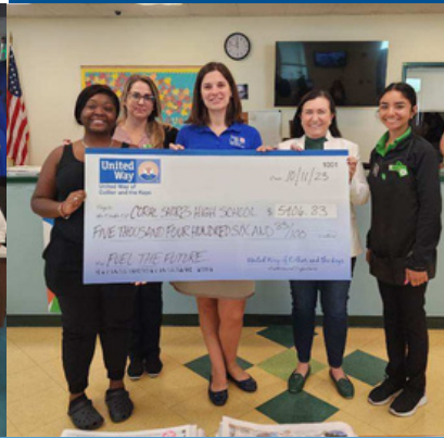
Coral Shores High